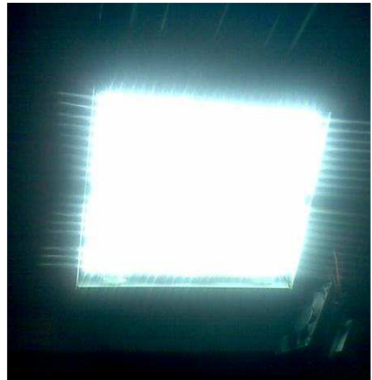
Figure 5: Light glow from the LED lamp