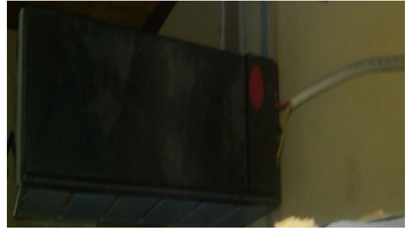
Figure 4: Connection to the Battery