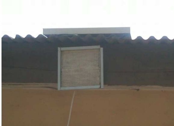
Figure 3: The Complete Installation

the sensor tells the switching circuit within the street light system to activate the flow of electricity and the electricity is sent through high-intensity discharge lamps. When the sensor detects too much light, the sensor will deactivate the street light (e.g., at dawn). Figure 3 and figure 4 show the complete installation and the connection to the battery respectively. Figure 5 also shows the working mode of the system.