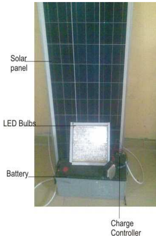
Figure 2: The Complete Connection